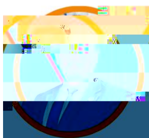
Sh.X. Shermatov Minister of Information Technologies and Communications Development of the Republic of Uzbekistan