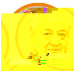
A.H. Kamilov Minister of Foreign Affairs of the Republic of Uzbekistan