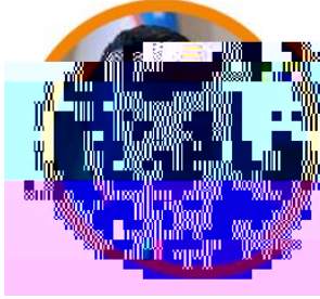
L. Sh. Kudratov First Deputy Minister of Investments and Foreign Trade of the Republic of Uzbekistan