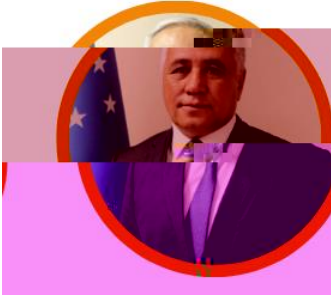
U.Sh. Begimkulov Deputy Minister of preschool education of the Republic of Uzbekistan, secretary of the organizing committee