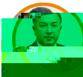
B.A. Musaev Minister of Health of the Republic of Uzbekistan