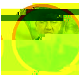
P.R. Bobojonov Minister of Internal Affairs of the Republic of Uzbekistan