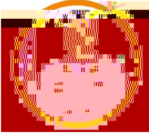
A.H. Kuldashev First Deputy Minister of Emergency Situations of the Republic of Uzbekistan