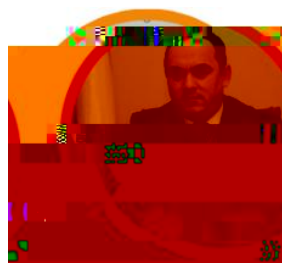
A.H. Tashkulov Minister of Higher and Secondary Special Education of the Republic of Uzbekistan