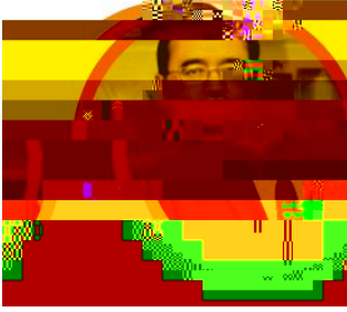
B.Q. Yusupaliev Head of the sanitary-epidemiological peace and public health service of the Republic of Uzbekistan