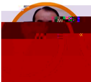
O.A. Nazarbekov Minister of Culture of the Republic of Uzbekistan